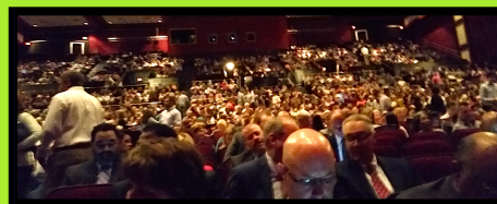
The Memorial Auditorium was standing room only for the Pieces of Gold Showcase last week.

So, there I was in an auditorium with literally thousands of spectators when the announcement came in... "And now the students of Leesville Elementary School with their performance from the Disney movie, The Aristocats ... Everybody Wants to be a Cat! I got goose bumps as they took the stage and an enormous sensation of pride as our Cubs performed beautifully... no, they performed like professionals. There was no fear, no anxiety. There was only passion and talent and a flawless delivery from our students. I kid you not when I tell you that I am still getting emails and calls from other Principals in the district to congratulate me on the amazing performance by Leesville Elementary School.