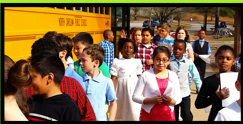
The young ladies and gentlemen of the LES 4th Grade looked as amazing as they behaved as they attended the Raleigh Symphony last week.